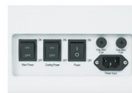
Independent Power Switch