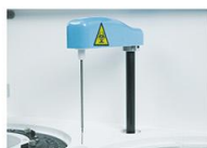
Sample&Reagent Probe Liquid level sensor function. Anti-collision function. Reagent volume real-time detection.