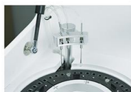
Washing Probe Independent 3 -step washing system.