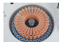
Reagent Tray Refrigerated tray with independent switch.