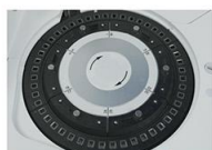
Reaction Tray 37±0.2°C, real-time monitor.