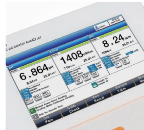
Large color touch screen Easy operation and comfortable experience