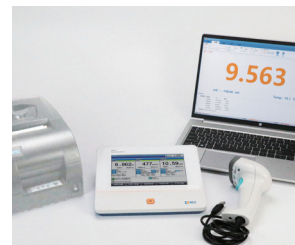
Multiple external devices available PC, autosampler, printer, scanning gun, USB flash disk, etc