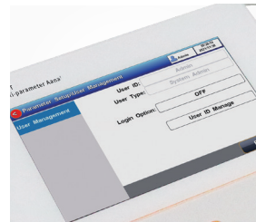
User management system