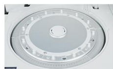
Reaction Tray 37±0.2°C, real-time monitor.