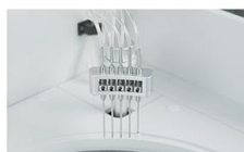
Washing Probe Independent 5-step washing system.