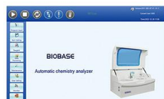
Software User-friendly software.