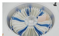
Reagent Tray 2~8°C cooling for 24 hours.