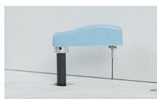
Mixer Probe Teflon coating to avoid cross contamination.