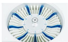
Reagent Tray 2~8°C cooling for 24 hours.