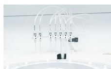
Washing Probe Independent 7-step washing system.