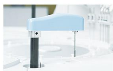
Mixer Probe Teflon coating to avoid cross contamination.