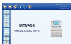
Software User-friendly software.