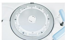
Reaction Tray 37±0.1°C, real-time monitor.